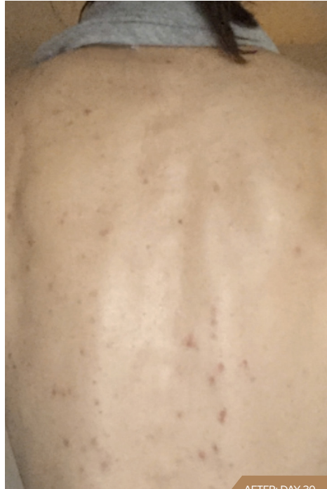
AFTER: DAY 30