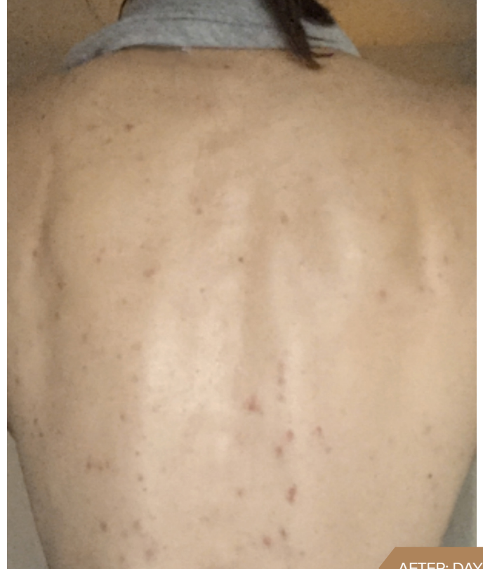
AFTER: DAY 30

Photograph taken by professional on mobile phone